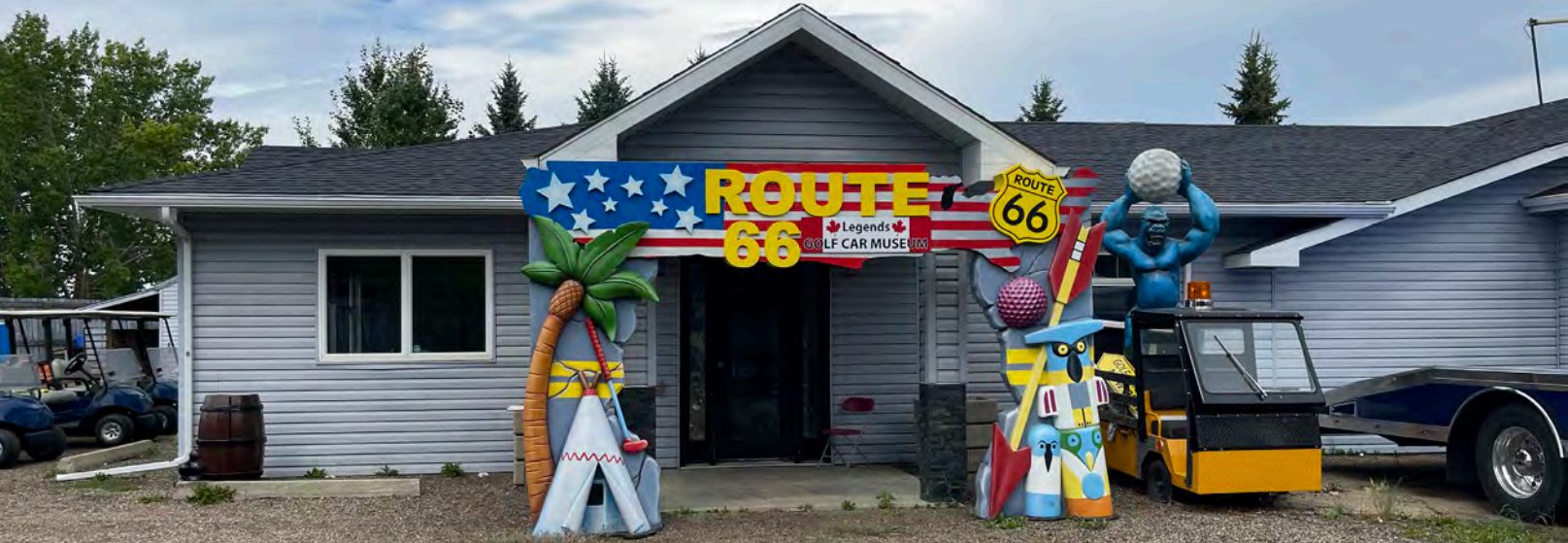
Photo Gallery - Legends Golf Car Museum